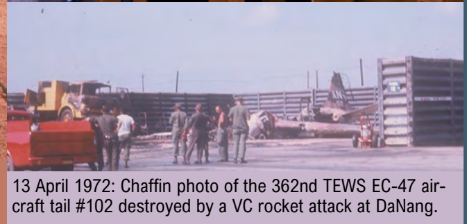
13 April 1972: Chaffin photo of the 362nd TEWS EC-47 aircraft tail #102 destroyed by a VC rocket attack at DaNang.