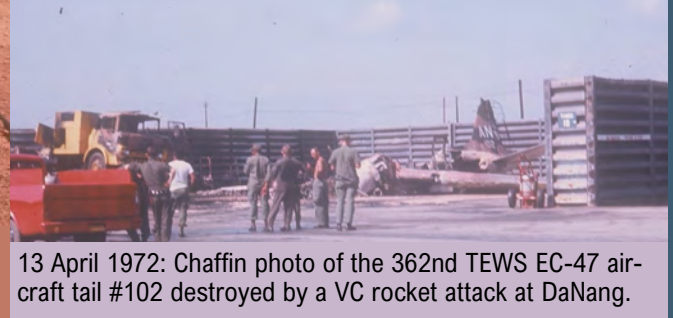
13 April 1972: Chaffin photo of the 362nd TEWS EC-47 aircraft tail #102 destroyed by a VC rocket attack at DaNang.