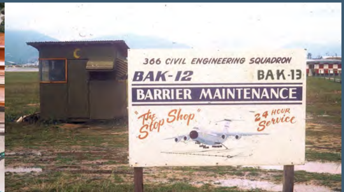
Above: The midfield location between the two runways where the barrier crews hung out and slept. Below: Gary Chaffin poses next to the BAK-12 engine at Ubon RTAFB.